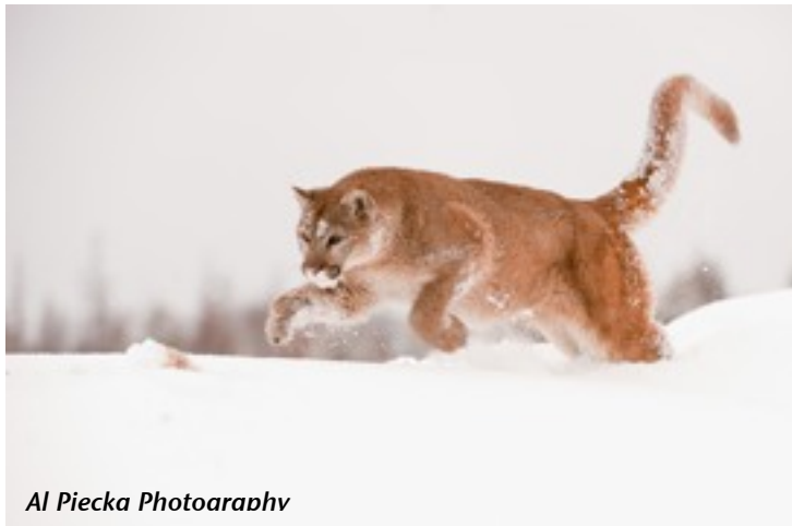
Al Piecka Photography

Al Piecka Photography 406 Perry Ave N. East Wenatchee, WA 98802 509-470-1669 abpiecka@hotmail.com alpieckaphotography.com